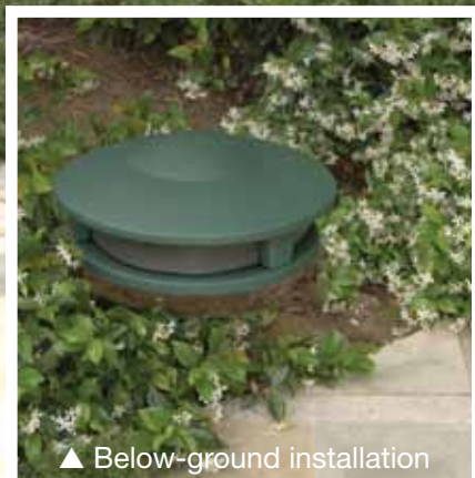
▲ Below-ground installation